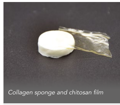
Collagen sponge and chitosan film