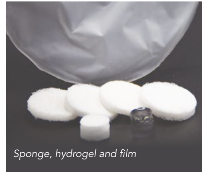
Sponge, hydrogel and film