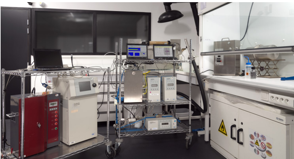
The Nanosafety Platform workstation measurement laboratory