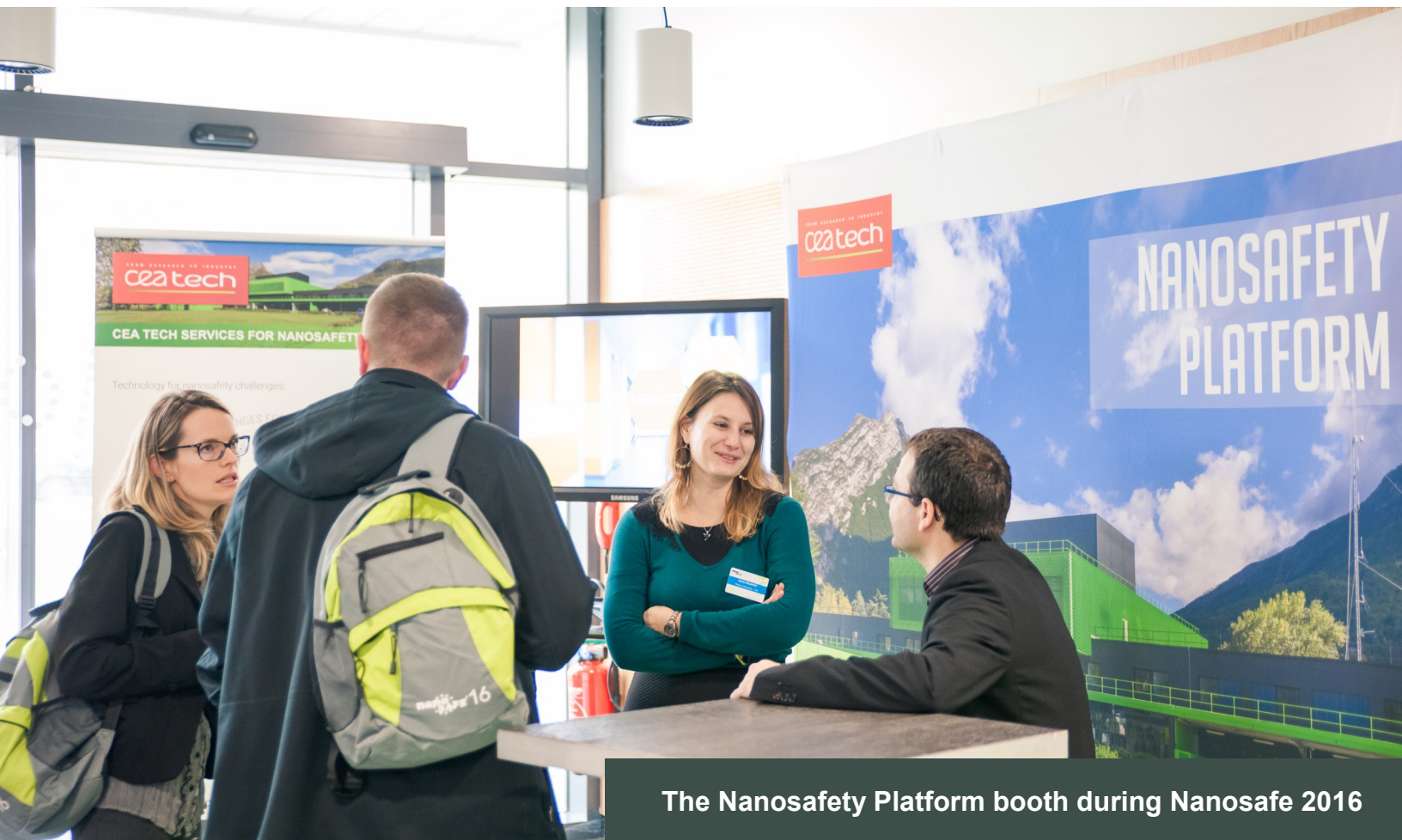
The Nanosafety Platform booth during Nanosafe 2016