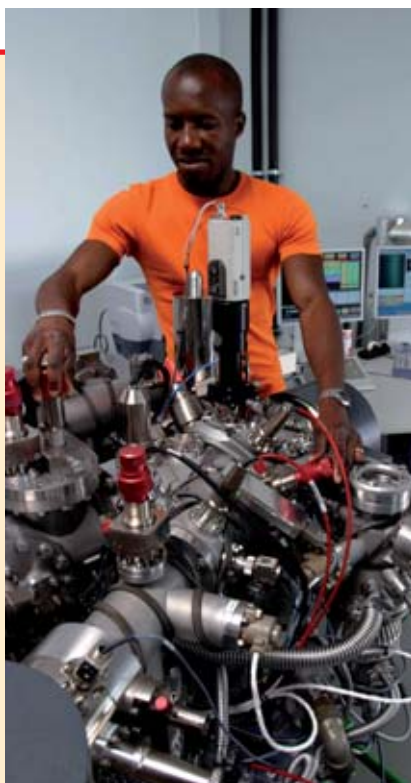
Spectromètre de masse d'ions secondaires utilisé au CEA pour réaliser des mesures isotopiques rapides sur un échantillon par exemple prélevé sur une installation aux activités nucléaires suspectes.

The principle of nuclear magnetic resonance (NMR) is based on the fact that an atom has a magnetic moment , just like a spinning charge acting as a tiny magnet, governed by quantum mechanics, aligning in a magnetic field as the needle of a compass in the Earth’s magnetic field. The principle of NMR consists in inducing, and detecting, the transition, for the nuclear magnetic moment, from the lowest energy level to the highest energy level, through absorption of electromagnetic radiation of a wavelength lying in the radiofrequency region: when the energy of the photon precisely matches the energy difference between the two levels, absorption occurs. Nuclei having numbers of protons , and neutrons that are both even exhibit zero spin. Carbon 12 and oxygen 16 atoms, which are very widespread in nature, thus have zero spin. On the other hand, hydrogen only has one single proton, and its nuclear magnetic moment equals 1/2: it may thus take on two possible energy states, corresponding to the two orientation states of its spin, relative to the magnetic field. Measuring the resonance frequency in the electromagnetic field allowing transition from one of these energy states to the other enables the molecu-