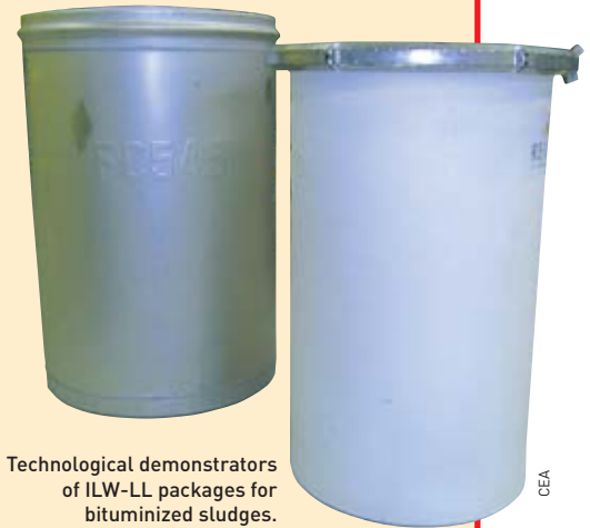
Technological demonstrators of ILW-LL packages for bituminized sludges.

Between the containers and the ultimate barrier provided, in a radioactive waste deep disposal facility, by the geological environment itself, there may further be interposed, apart, possibly, from an overpack, other barriers, so-called engineered barriers , for backfill and sealing purposes. While these would be pointless as backfill in clay formations, they would have the capability, in other environments (granite), of further retarding any flow of radionuclides to the geosphere , notwithstanding degradation of the previously mentioned barriers.