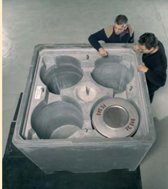
CEA design study for a common container for the long-term storage and disposal of long-lived, intermediate-level waste.

( ILW-LL ) in conditions of safety, pending a long-term management mode for such waste. Retrieval of stored packages is anticipated, after a period of limited duration (i.e. after a matter of