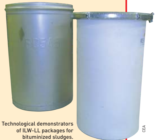
Technological demonstrators of ILW-LL packages for bituminized sludges.

Between the containers and the ultimate barrier provided, in a radioactive waste deep disposal facility, by the geological environment itself, there may further be interposed, apart, possibly, from an overpack, other barriers, so-called engineered barriers , for backfill and sealing purposes. While these would be pointless as backfill in clay formations, they would have the capability, in other environments (granite), of further retarding any flow of radionuclides to the geosphere , notwithstanding degradation of the previously mentioned barriers.